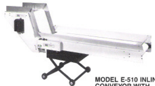
MODEL E-510 INLINE CONVEYOR WITH E-400 SEPARATOR