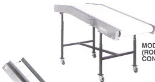
MODEL E-530 DECLINE (ROBOT UNLOAD) CONVEYOR

This engineered design with its exceptional features provides you with a clean, versatile, portable (if required), heavy industrial duty unit that is ready to run, quickly and easily serviceable if necessary, and assures years of optimum performance and durability.