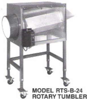
MODEL RTS-B-24 ROTARY TUMBLER SEPARATOR