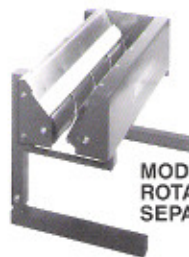
MODEL RSS-24 ROTARY SCREW SEPARATOR

See reverse for a list of our capabilities. We look forward to serving your parts handling requirements!