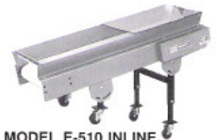
MODEL E-510 INLINE (UNDER PRESS) CONVEYOR