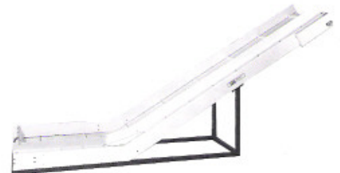
MODEL E-525 INCLINE (BESIDE PRESS) CONVEYOR