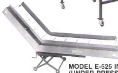
MODEL E-525 INLINE (UNDER PRESS) CONVEYOR