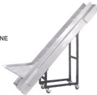
MODEL E-510 INCLINED ELEVATING, OR GRINDER FEED CONVEYOR