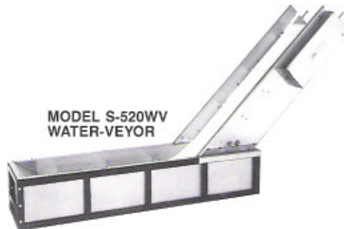
MODEL S-520WV WATER-VEYOR