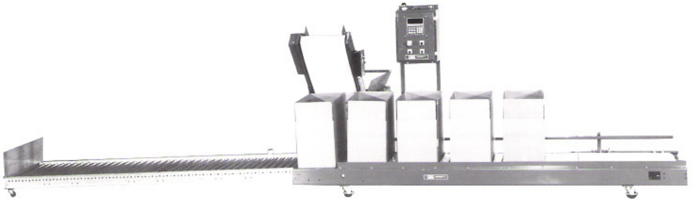
Typical Weigh/Count System with E-525 feed conveyor receiving from injection molding machine, feeding cartons oriented in-line, adjacent to the press.